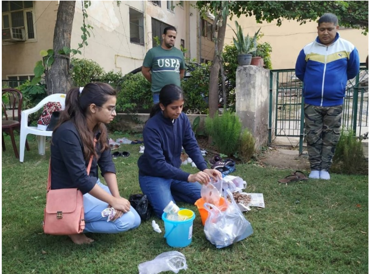
Workshop on Bio-Composite