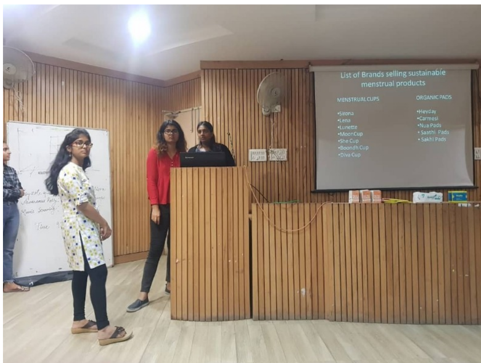
Project MENO: Workshop on the use of Menstrual Cup