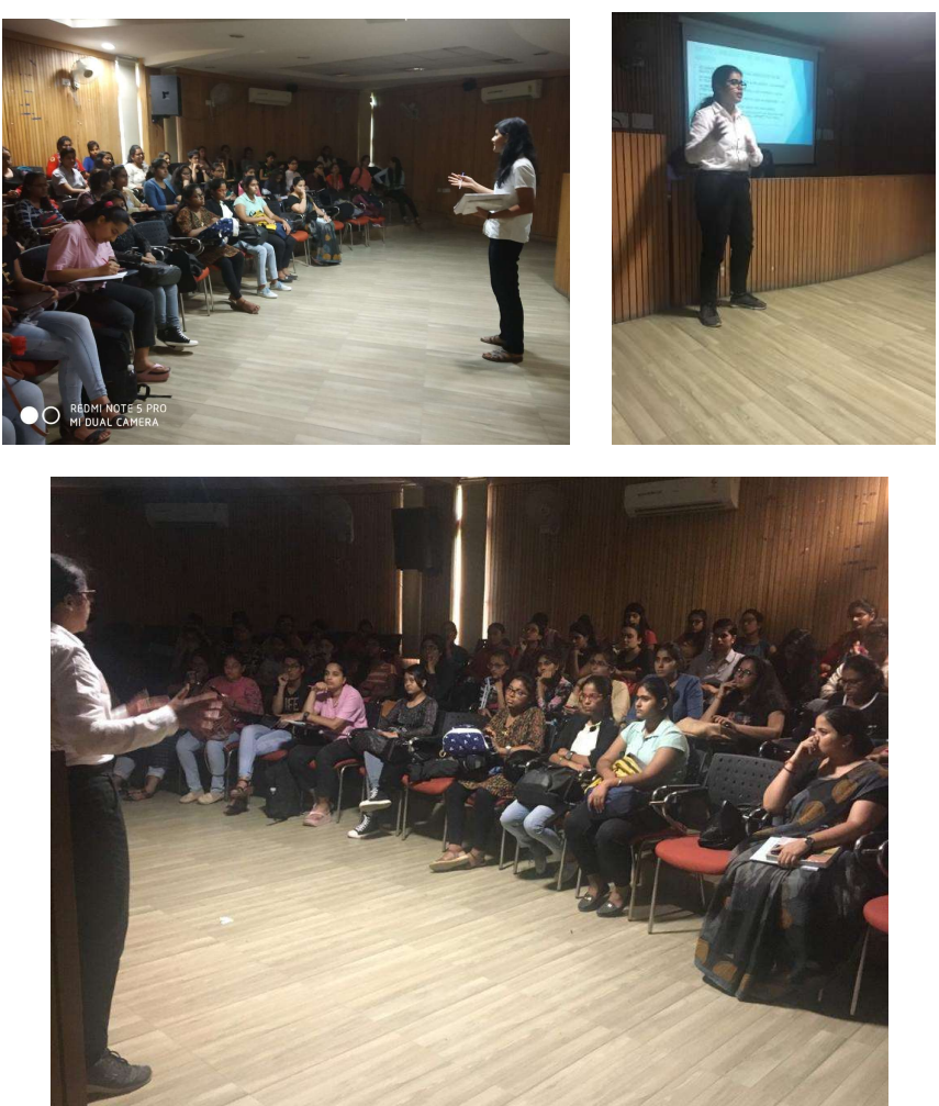
Student Coordintaors, Training and Placement Cell, Bharati College addressing the Bharati College students