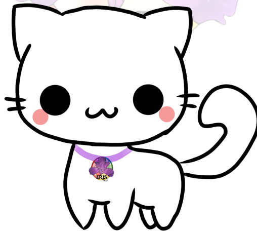
Miyoko, Iris' mascot (they, them)