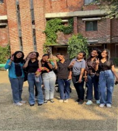
Joy of giving[25th Oct,23]