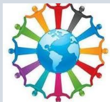
Equal Opportunity Cell

To do so, it keeps a close watch on the infrastructural needs of differently-abled persons within the College like Braille signage installed in various key places across the College; creating ramps for safer and convenient mobility; creating separate lavatories; by creating a Knowledge Hub equipped with laptops with relevant reading software and reading material for the exclusive use of visually-challenged students; and by routinely shifting the timetable so that classes for students with locomotor disabilities are held on the ground floor. It also attempts to tackle social taboos attached to disabilities by organizing workshops and lectures for the College community at large. It works towards building self-confidence in our differently-abled students by